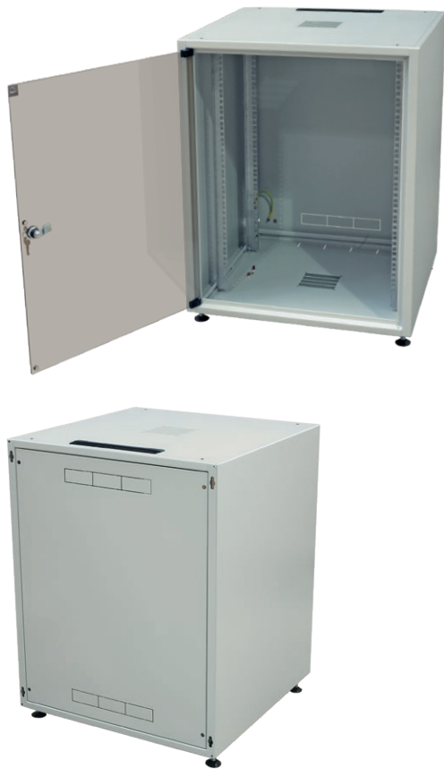
SJB 15 U cabinet finished in RAL 7035, without desktop