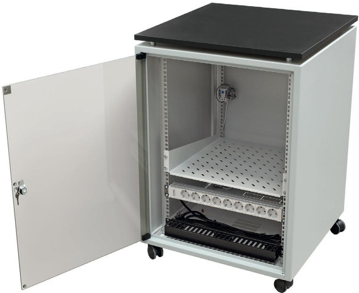
SJB 15 U cabinet finished in RAL 9005, equipped with black desktop, castors and other accessories