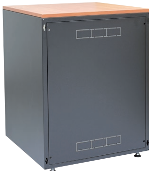
SJB 15 U cabinet finished in RAL 9005, with desk- top made of Calvados-laminated MDF board